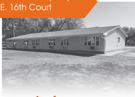
Photo of Property E. 16th Court